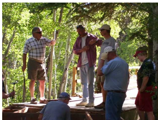
Upper Left: Education Institute Registration. Upper Right: Girl Scouts Give-A-Day. Lower Left: Construction Career Days. Lower Right: Wilderness On Wheels.